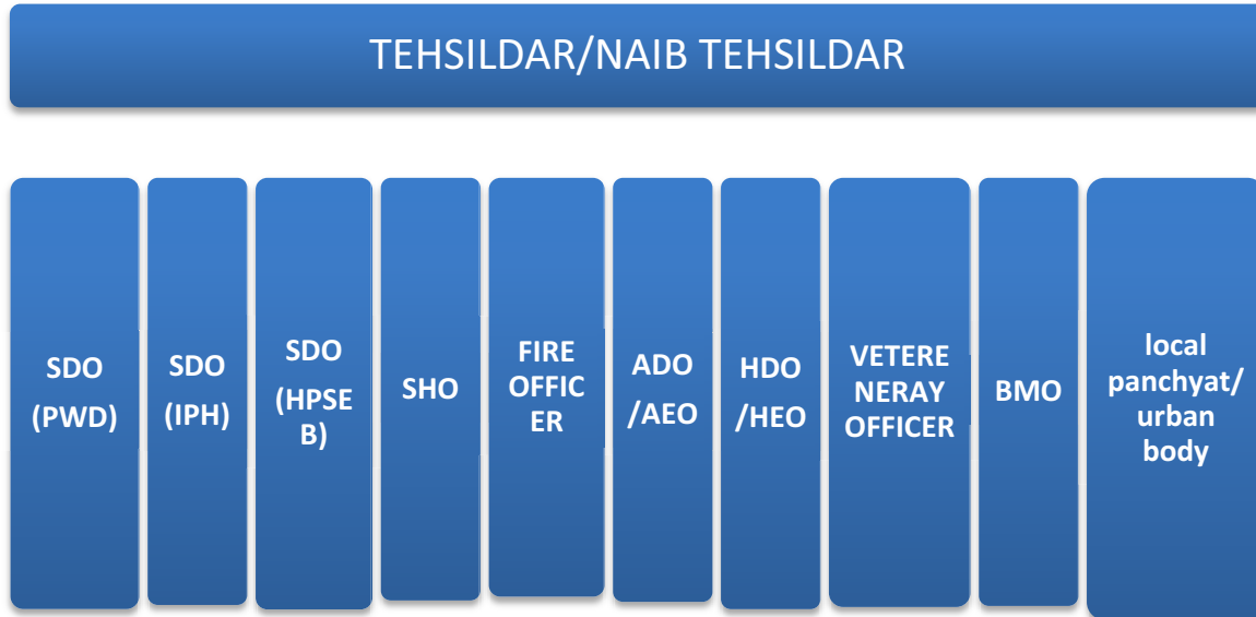
Figure 6.4: RAPID DAMAGES ASSESSMENT TEAM

A team headed by Thesildar/Naib Tehsildar of the area concerned and officers from PWD ,IPH, HPSEB, not below the rank of SDO and Health department BMO along with SHO and Fire officer if available locally ,will immediately rush to the spot and first hand assessment of damages and loss so done shall be forwarded to the SDM concerned for further dissemination to the DEOC. Thereafter this team will assess daily the situation and send its report on the proforma annexed as Annexure-VI. The organization of rapid assessment damage team will be as follow:-